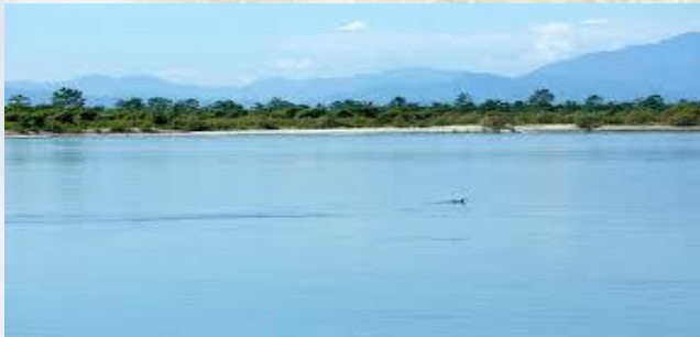
DAYING ERING WILDLIFE SANCTUARY