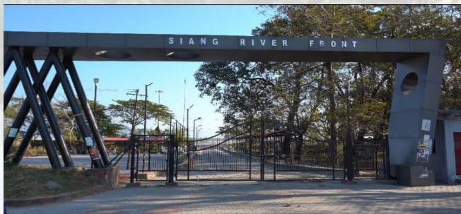
SIANG RIVER FRONT